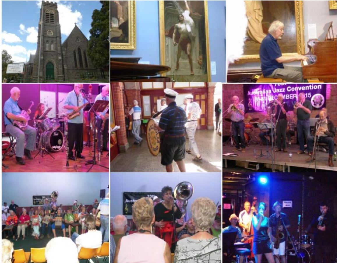
The 70 th Australian Jazz Convention Ballarat 2015